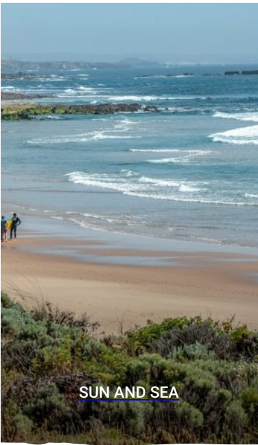
SUN AND SEA