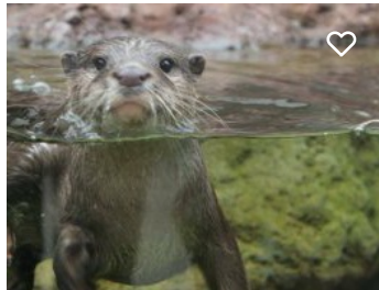
Fluviário de Mora