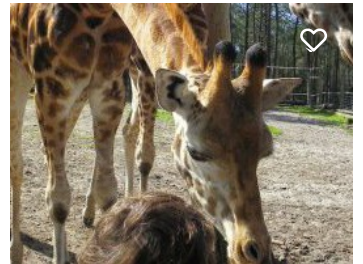
Badoca Safari Park