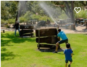
Reserva Animal Monte Selvagem