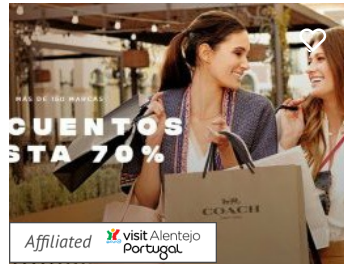
Freeport Lisboa Fashion Outlet