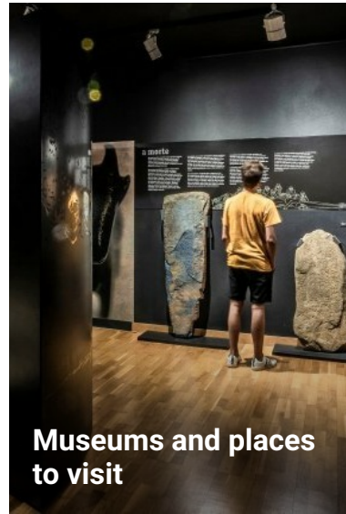
Museums and places to visit