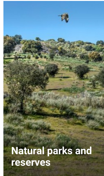
Natural parks and reserves