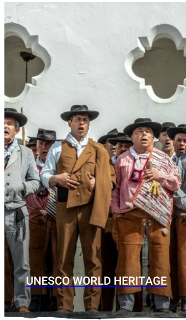
UNESCO WORLD HERITAGE