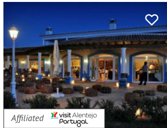
Restaurante Herdade dos Grous