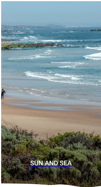
SUN AND SEA