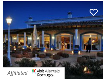
Restaurante Herdade dos Grous