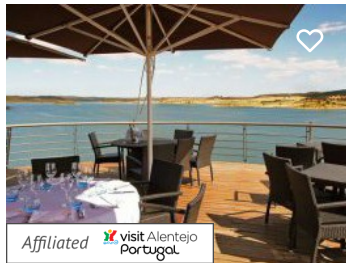
Restaurante Panoramico da Amieira Marina